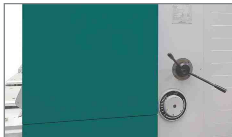
Blade clearance adjustment