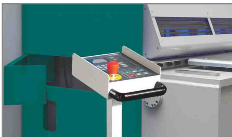
Movable control station with integrated CN *Machine with optional equipment.

All data are approximate. Specifications are subject to changes without notice. Shown specifications may vary from country to country. For different configurations consult your Adira specialist.